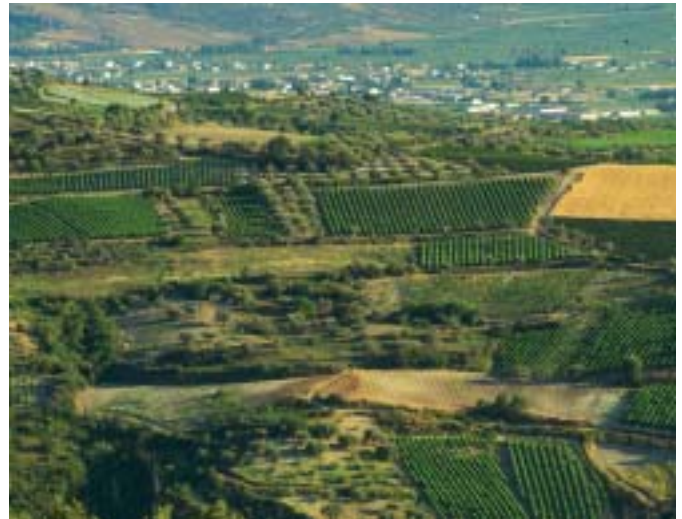
The picturesque rolling hills draw comparisons to Tuscany.

All wineries are open by appointment. For general information on Greek Wines, visit www.allaboutgreekwine.com .