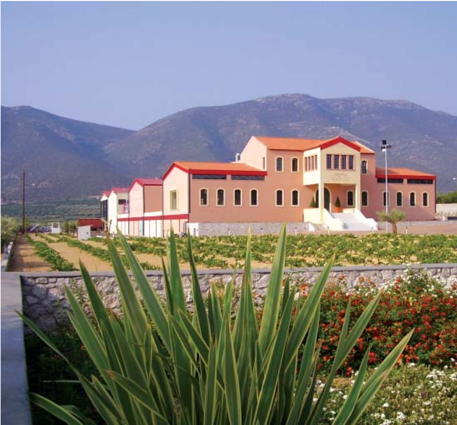
Domaine Skouras produces striking wines with native grapes like Roditis as well as international varieties Chardonnay and Viognier.