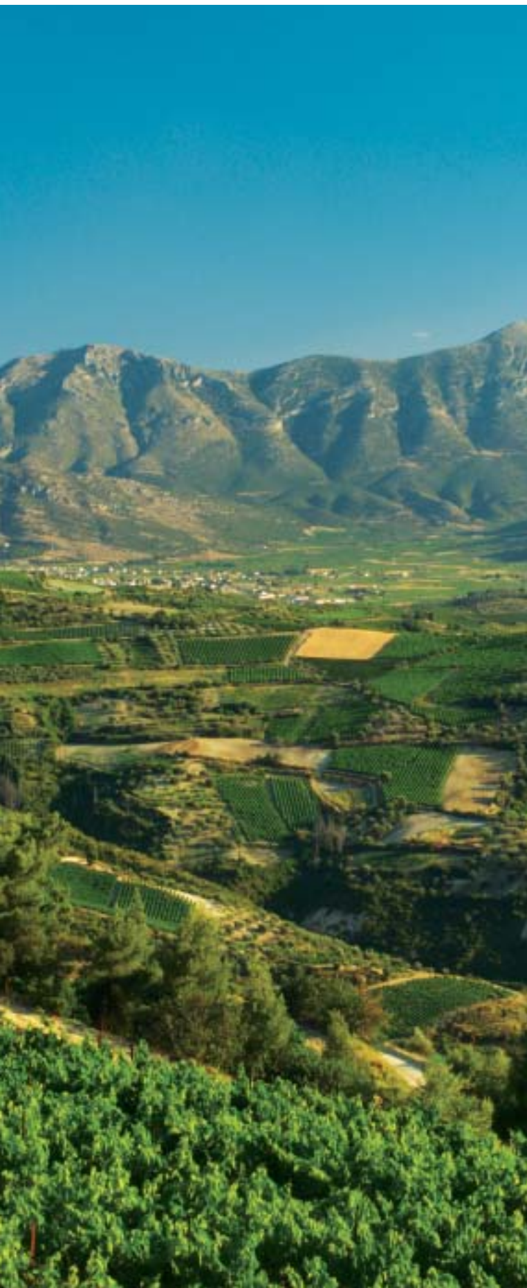
make for unforgettable scenery.

wine appreciation or inside contacts. The Greek spirit of kerasma , of sharing gifts of food and drink with strangers is alive and well in the heart of the ancient world. The craftspeople of these fine wines are awaiting you with open spigots, eager to make known to the outside world the remarkable quality wines that have emerged in the last decade.